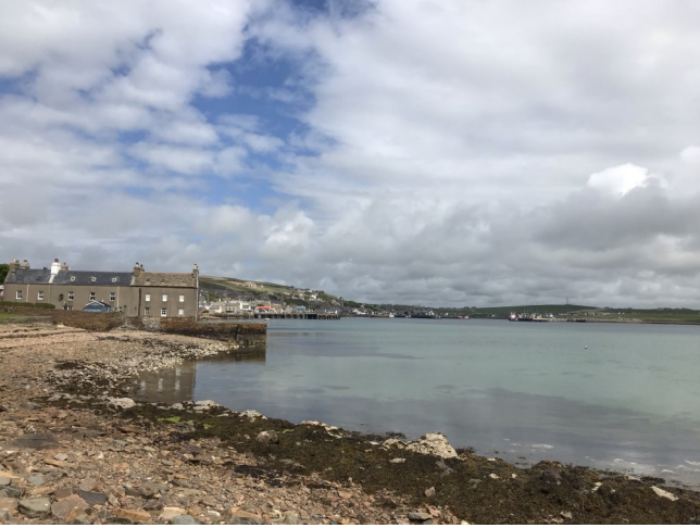
This was Stromness last Sunday morning

Final music - Farewell to Stromness, Peter Maxwell-Davies - https://www.youtube.com/watch?v=zpJB-XXE9Xg