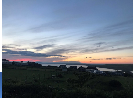
This was sunset at 11 pm on Tuesday