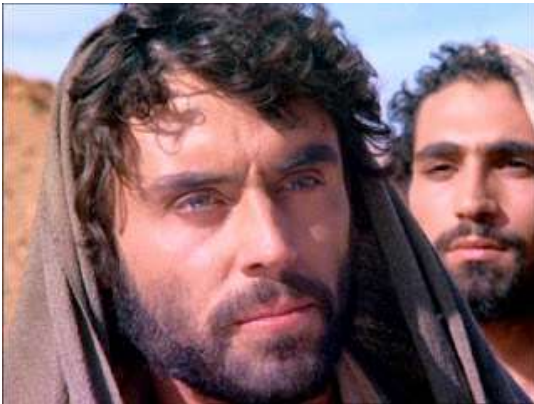
Ian McShane in “Jesus of Nazareth”

Peter is being practical. From those twelve men one is missing, Judas “who became a guide for those who arrested Jesus”, but who “was allotted his share of the ministry”. Some sources suggest that he was the sort of treasurer of the group surrounding Jesus, and that his comments at the time of the woman anointing Jesus with the expensive ointment reflect that. It is probable that he was amongst the twelve that were sent out to minister to the villages, and is mentioned in the names of the twelve disciples. In the gospel reading for today he is called “the one destined to be lost so that the scripture may be fulfilled”, so we know that he was remembered.