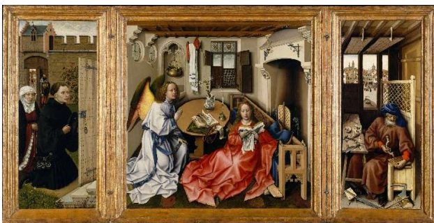
Triptych with the Annunciation, Robert Campin

I said earlier that Peter was being practical in his suggestion that they needed another person to replace Judas, and it is good that they had a choice of two people. I'm not sure of the exact format of how they drew lots, but I suppose it meant that the choice was not a popularity contest, or a test of those who shouted loudest, but a chance for God's will to be known in a certain way. I'm told that Matthias went on to do great things. I hope that the multi named Joseph – Barsabbas – Justus found a role that suited his abilities; there was probably a good chance of it as the overall effect of the work of the first followers of the risen Jesus were by any account impressive.